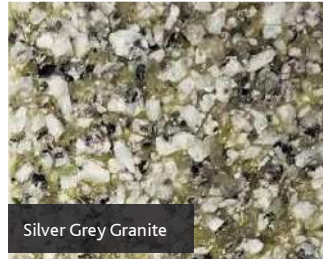
Silver Grey Granite