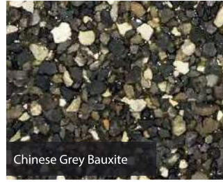
Chinese Grey Bauxite