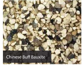
Chinese Buff Bauxite